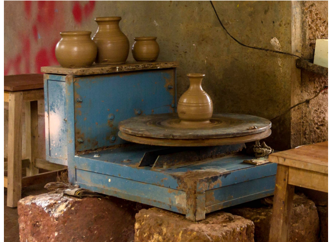
(A) Delhi Wheel - Dharma Industries