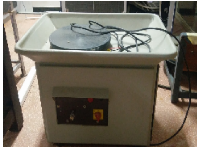
(B) Bangalore Wheel - Sri Janani Engineering