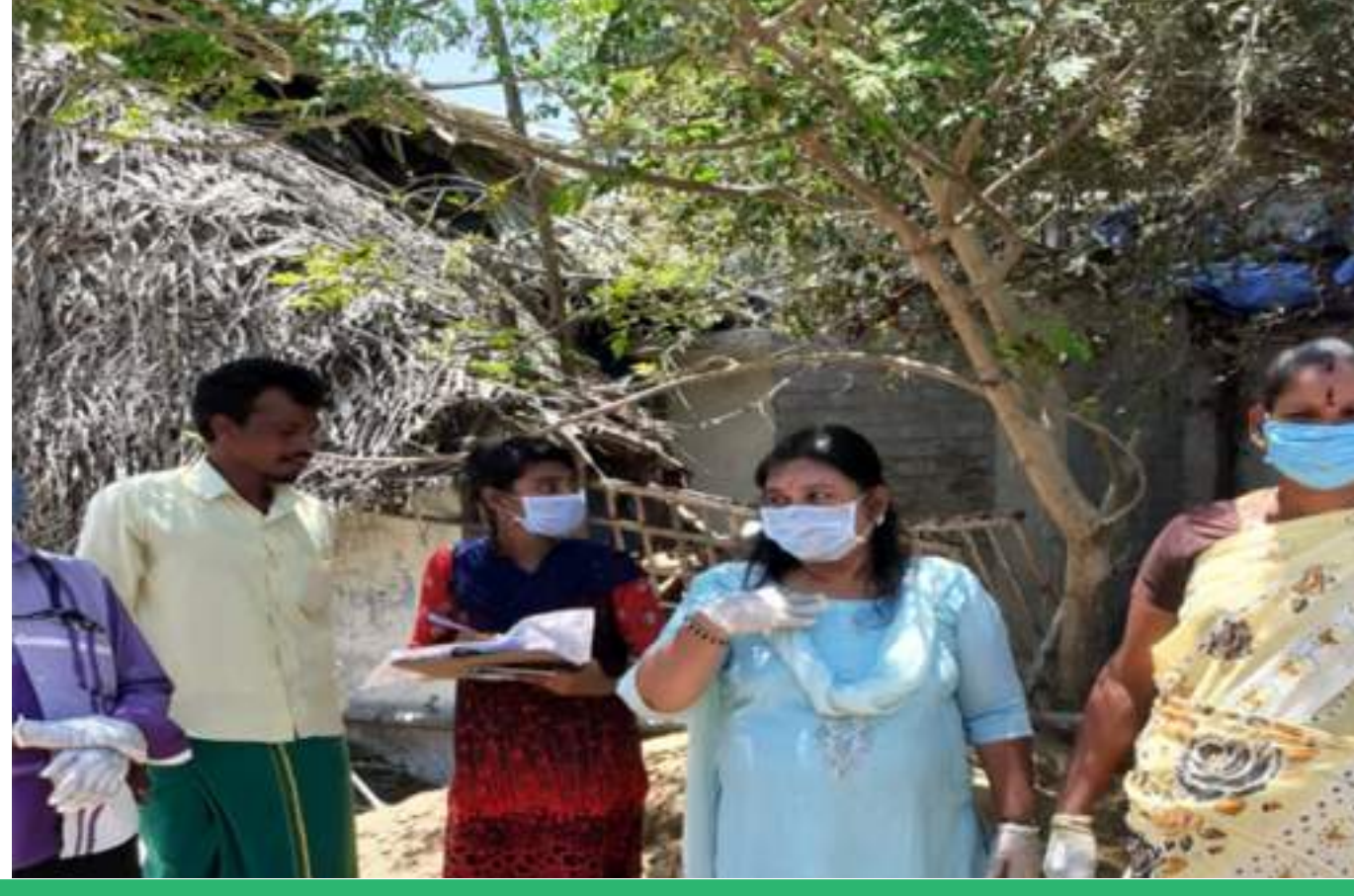
Examples of livelihoods trainings for migrants post social distancing protocols (individual and training centers)