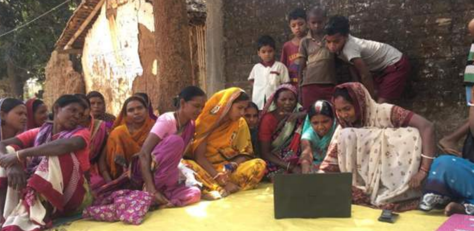
Examples of web based ongoing training programs for small groups and one-on-one mentorship programs