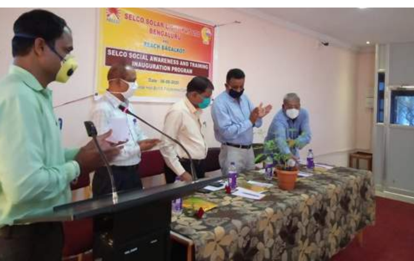
Mobile Livelihood centers and block level live demonstration and graduation centers for practical trainings