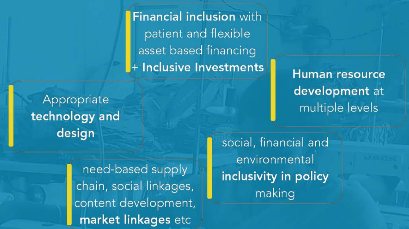
The Ecosystem - From an End User Perspective

For example the solar powered roti (bread) rolling solution consists of: a highly efficient roti rolling machine, asset-based finance for an entrepreneurs to own the machine, schemes and policies that support that system, micro-entrepreneur market linkage training for the roti rolling businesses and an enterprise that can provide and service the packaged solution with solar energy. The enabling stakeholders or factors that needed to be supported or influenced in such a case included rural financial institutes, technology providers, the solar based enterprises, training institutes etc.